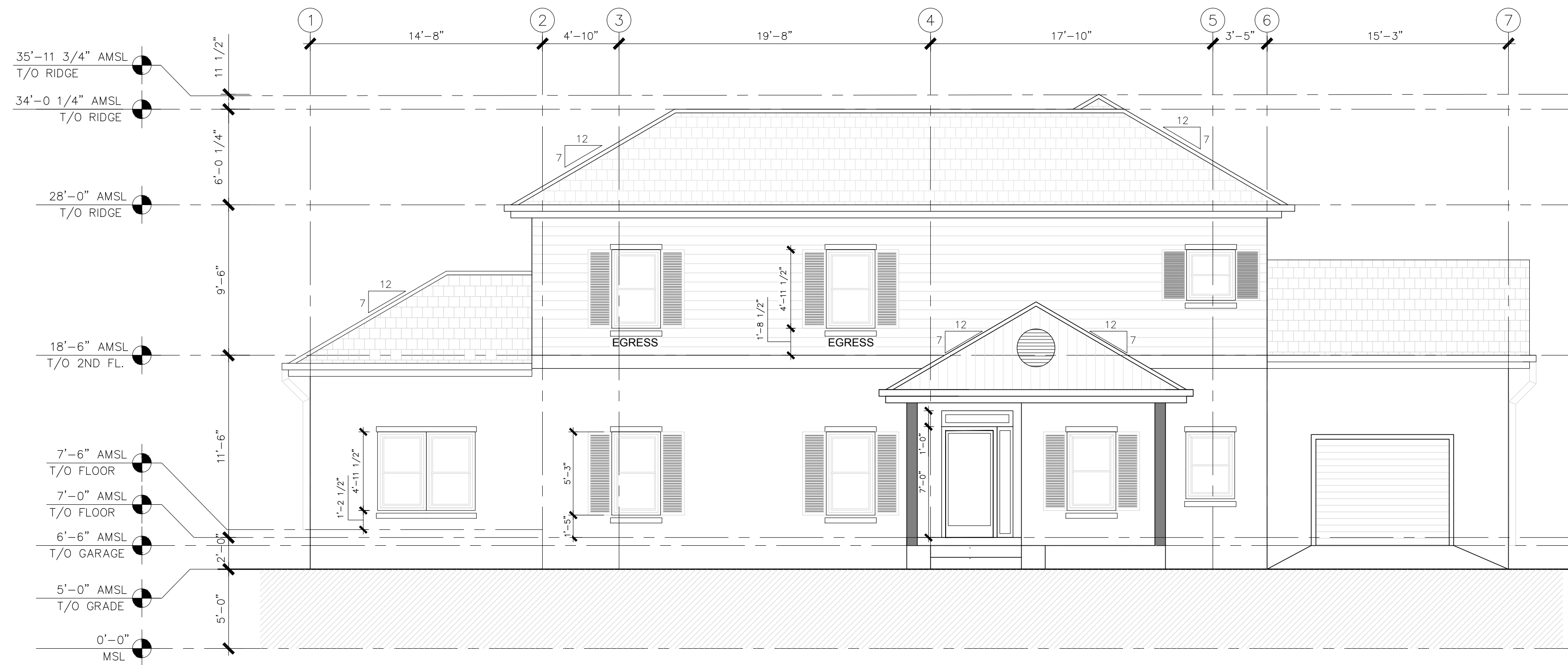
NORTH ELEVATION SCALE : 3/16"=1'-0"