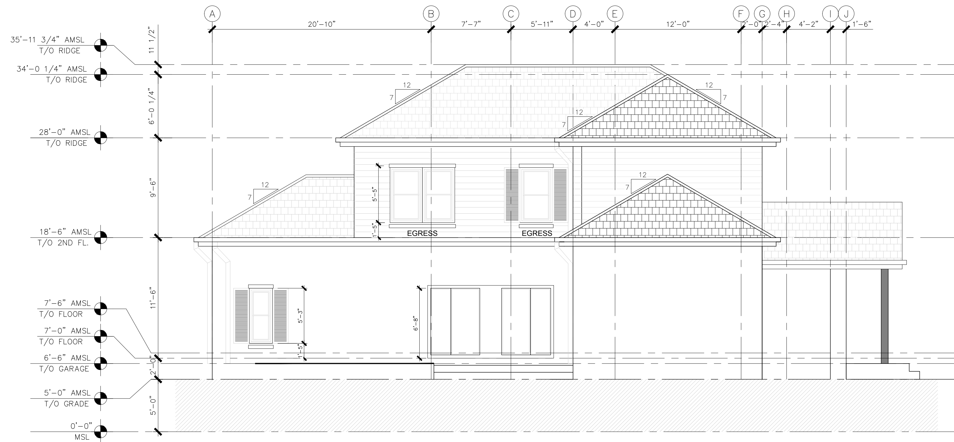
EAST ELEVATION SCALE : 3/16"=1'-0"