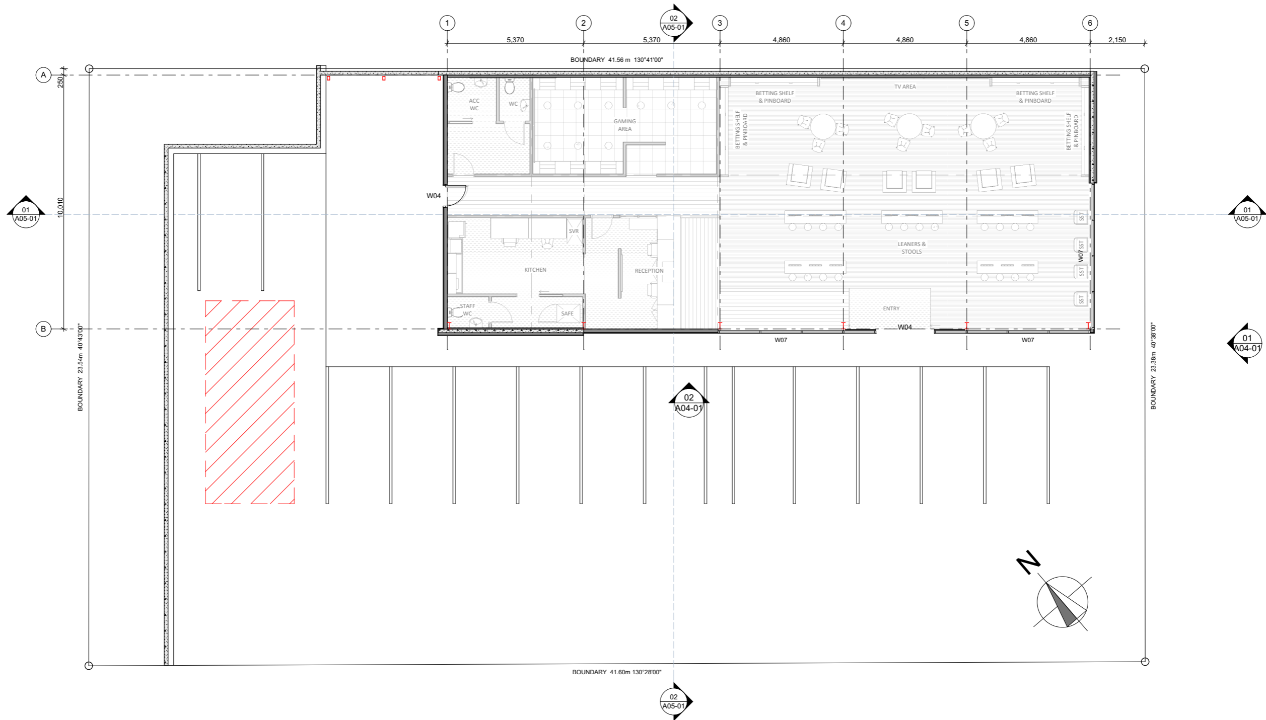
01 Site Plan - Scale 1:150